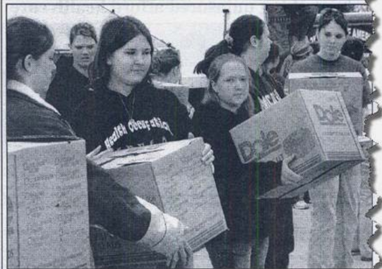
HUMAN CONVEYOR BELT - Volunteers from St. Joseph Health System, HealthKey, Iosco Regional Educational Service Agency (IRESA) and Boy Scouts joined forces last week to help feed more than 900 area residents through a Mobile Food Pantry in observance of National Cover the Uninsured Week. Pictured above are IRESA students helping to unload and stack over 15,000 pounds of food, while others disbursed boxes of food to 317 families, who came to the distribution point, and to shut-ins in the Tawas area. St. Joseph Parish Nurses also took blood pressures as part of their St. Joseph Health System's health check-ups.